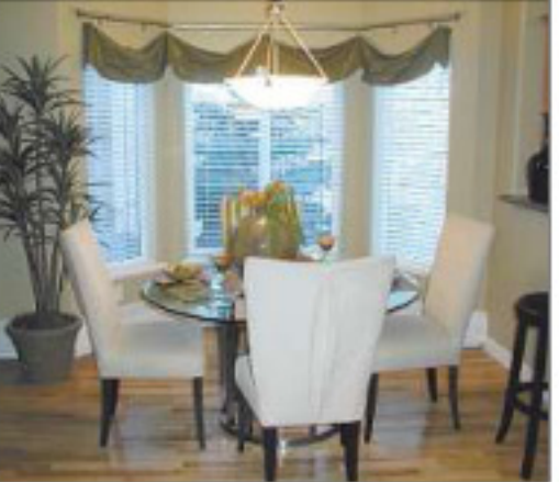
Bay window adds light to the nook.

from the Richmond Hill shopping area and on the way to the beauty of the Kananaskis along Highway 8.