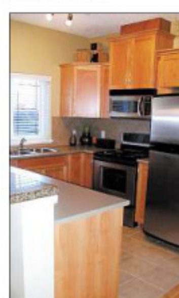
U-shaped kitchen has a granite eating bar opening to the nook and living room.