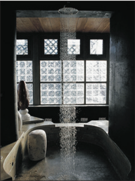
The shower pours water from the ceiling into the concrete bathtub.

Built at the back of the house where the original bathroom and sitting porch with skylight once stood, the bathroom has now doubled in size to about six-by-six metres. Like a Roman bath gone industrial, the focal point of this room is a massive poured concrete tub, the material studded with aggregate composed of bits of glass, steel and ceramic. Splashes of colour lighten the scene in the form of three paintings by artist Louise Markus, the owner's ex-wife, and from the large oval forms near the outer windows created by sculptor Jordi Alfaro, who also fashioned ceramic holders along the walls and rounded ceramic cabinets around the perimeter of the bath. All are made in a smooth white finish, to contrast with the rough concrete and oxidized steel, the darker elements in the room. Alfaro also made the ceramic stool that sits in the bath itself, etched with drawings by Jai Granofsky, an illustrator. "My mother calls it 'a modern-day Ming vase,'" said Granofsky, who is overseeing the final stages of work on the house, while his father, a computer animator turned musician, is on a photographic expedition in India. Babou is given pride of place in the room, honoured by dozens of British bulldog figurines the family collects. They are displayed in the recessed shelves designed expressly for that purpose. The space, says Granofsky, is one of his favourite haunts in the house. The raised sink in opaque tempered