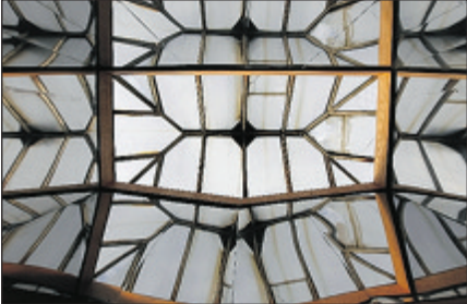
The skylight lends even more light and design flair to the bathroom.